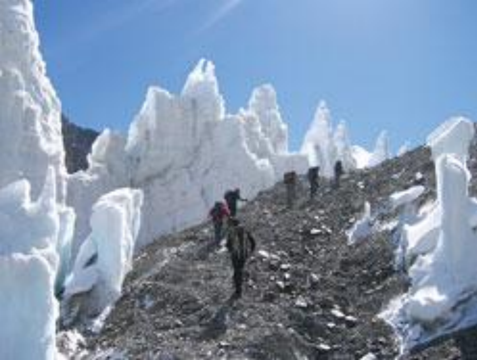
MAGIC HIGHWAY: These ice towers on the Rongbuk Glacier on the north side of Mount Everest were twice as big 20 years ago.